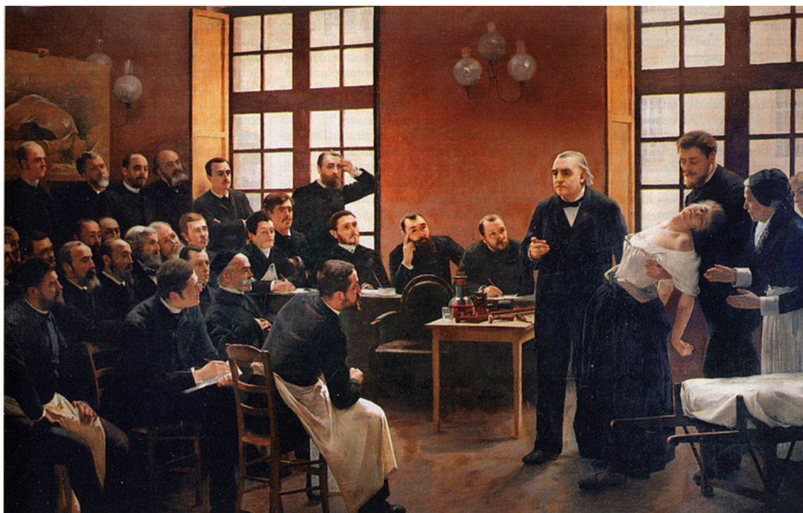
Figure 1 Une leçon Clinique à la Salpêtrière , Brouillet, 1887. Georges Gilles de la Tourette is seated in the front row wearing an apron, leaning attentively forward.

than usual in the context of the consultation room but then do become more noticeable as the appointment progresses. Occasionally a single examination cannot confirm a credible history of tics. All published descriptions use the idiom ‘wax and wane’, and most patients do describe some weeks or months as being more or less severe for no special reason. They are also generally aware of new tics appearing and old ones disappearing over time, and of having orchestrated sequences of certain tics. Some tics have a compulsive quality and merge into other obsessional symptoms. Examples are ticcing a certain number of times, ticcing until it feels ‘just right’ (eg, painfully tensing the neck,