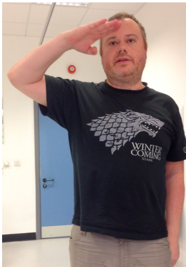
Figure 2 Still of video 1: complex motor tics.

Patients with other movement disorders do not generally describe this arc of urge–suppressibility–tic–relief. For some people, the urge is a focal feeling of the part of the body that has to move; for others it is more diffuse or not articulated in such somatic terms. Tic suppression is sometimes a physical tensing; for others it is a more psychic process that is hard to explain. For a few patients the urge and/or effort of suppression is so unpleasant that